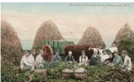
Husking corn at Oakland Farm, c. 1900