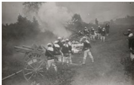
In 1923 re-enactors relived the Battle of Rhode Island.

The British finally departed from Aquidneck Island in December 1779, thus ending the occupation. It took years for the citizens