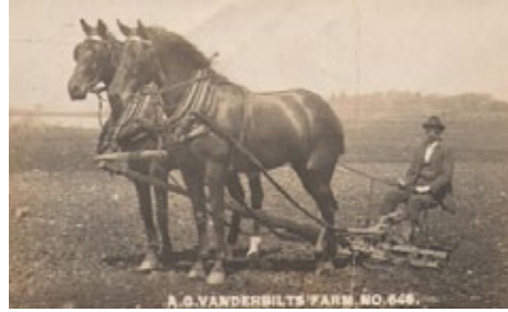
A handsome pair of plough horses at Vanderbilt's Oakland Farm

original generation grew older and passed on, their descendants preferred other pastimes and other places to live and work. The large farms were sold to developers for new housing, although a few buildings were utilized for other purposes. The J. C. Taylor mansion at Glen Farm, for instance, first became a Catholic school and convent and then, when purchased by the town, has become a popular venue for weddings and special events. The barns at Glen Farm still house horses and hold equine activities. In the 1980's residents of Portsmouth voted to purchase Glen Farm property when it went on the market. The former farmland now provides recreational opportunities for townspeople with playing fields, polo grounds, and walking trails and preserves open space and a superb vista across the Sakonnet River.