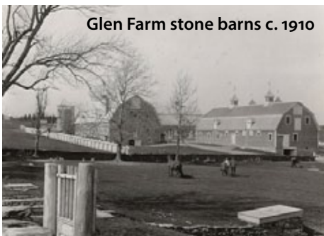
Glen Farm stone barns c. 1910

As time went on vast estates became increasingly expensive to maintain and, as the